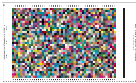
ICC color test chart

All settings can be stored in so-called Sequence-Template. These can include e. g. settings about preflighting, color management or media/output settings.